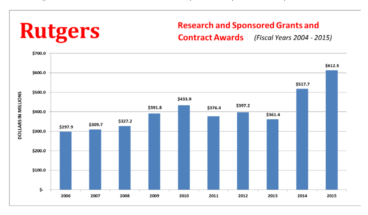
In fiscal 2015, Federal Grants and Contracts revenue amounted to $302.5 million or 51.7% of total grant and contract revenue. This year the university was awarded grants from various federal agencies including:

The following table summarizes the research awards received by the university over the last 10 years.